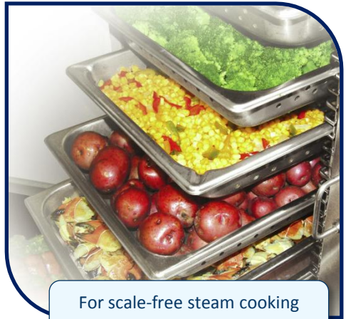
For scale-free steam cooking equipment

Everpure Claris is truly different and the perfect compact solution.