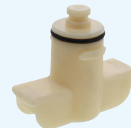
EV3093-96 BW Head Plug