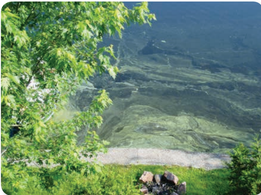
Colonies of microscopic blue-green algae appear on a lake during a bloom. Blooms occur mostly during late summer and early fall.

Human activities can promote the growth of blue-green algae. For instance, agricultural, urban and stormwater runoff, effluent from sewage treatment plants and industry, and leaching from septic systems can elevate the levels of nutrients in water bodies, which can promote algae growth. Reducing or eliminating nutrient inputs from these sources is a proactive way to reduce the occurrence of blue-green algal blooms.